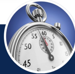
Problem of Practice