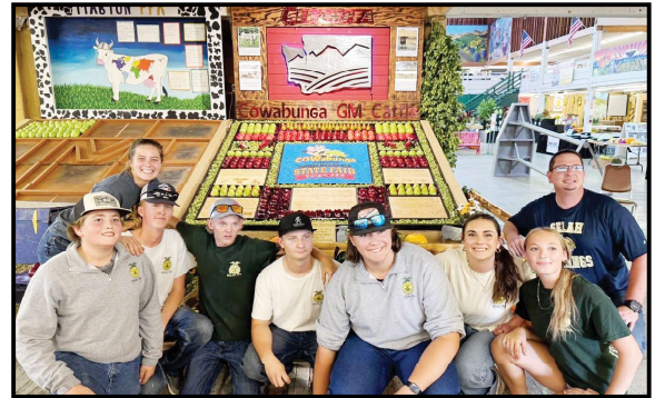
Selah High School FFA students proudly pose in front of their award recognized display.

C owabunga! It was fair time, and Selah High School FFA students hit it big again with their impressive agricultural display! Their creativity and hard work earned Selah's FFA team proud fourth-place honors at this year's Central Washington State Fair. These dedicated students put in countless hours designing, constructing, and assembling every detail of their exhibit, making sure it was polished to perfection where the final display was bursting with school spirit, community pride, and plenty of agricultural fun! Now that's, Cowabunga!