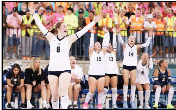
Under the lights, the Selah High School volleyball team, hosted a memorable outdoor match in September.

games and soccer matches, the stadium was transformed into an open-air volleyball court—creating a distinctive setting for the match. Water damage to Selah's gymnasium has prevented the volleyball team from playing at the high school until at least October, with home varsity and junior varsity matches relocated to Selah Middle School. But, with perfect temperatures, the Viks played under the lights in an impressive and memorable volleyball showdown!