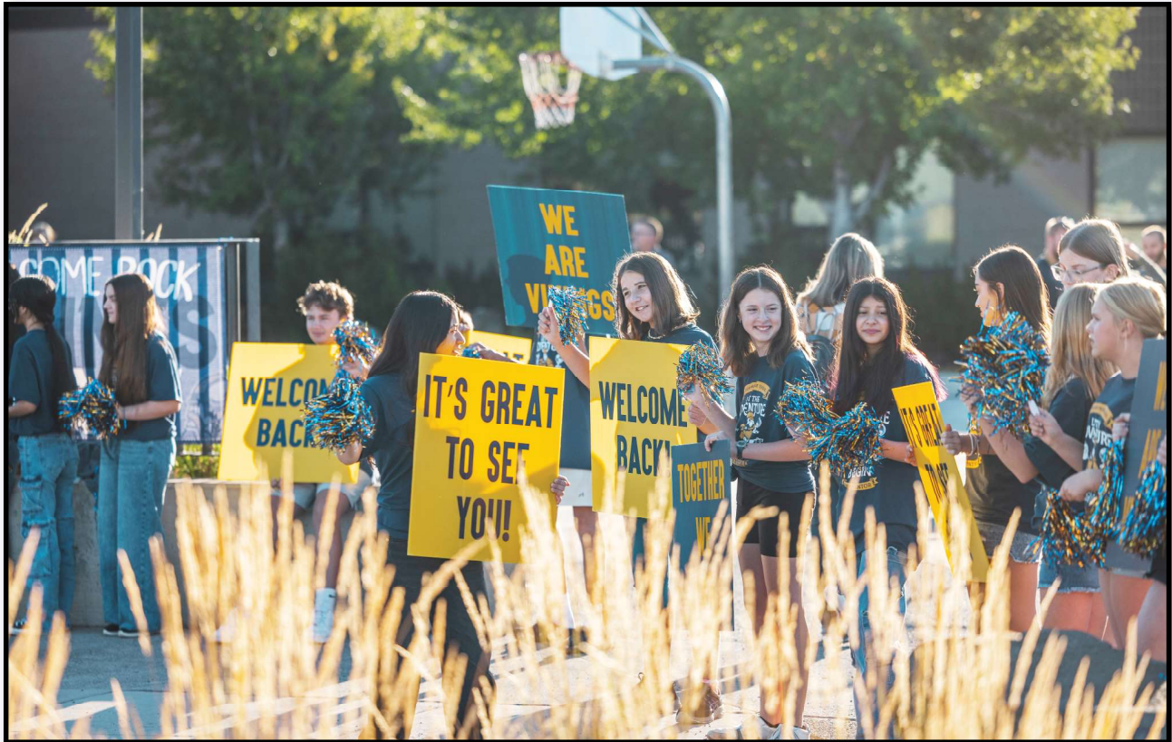
Selah students are back at it again! One month of classes is already in the books for students! It's going to be a great year!