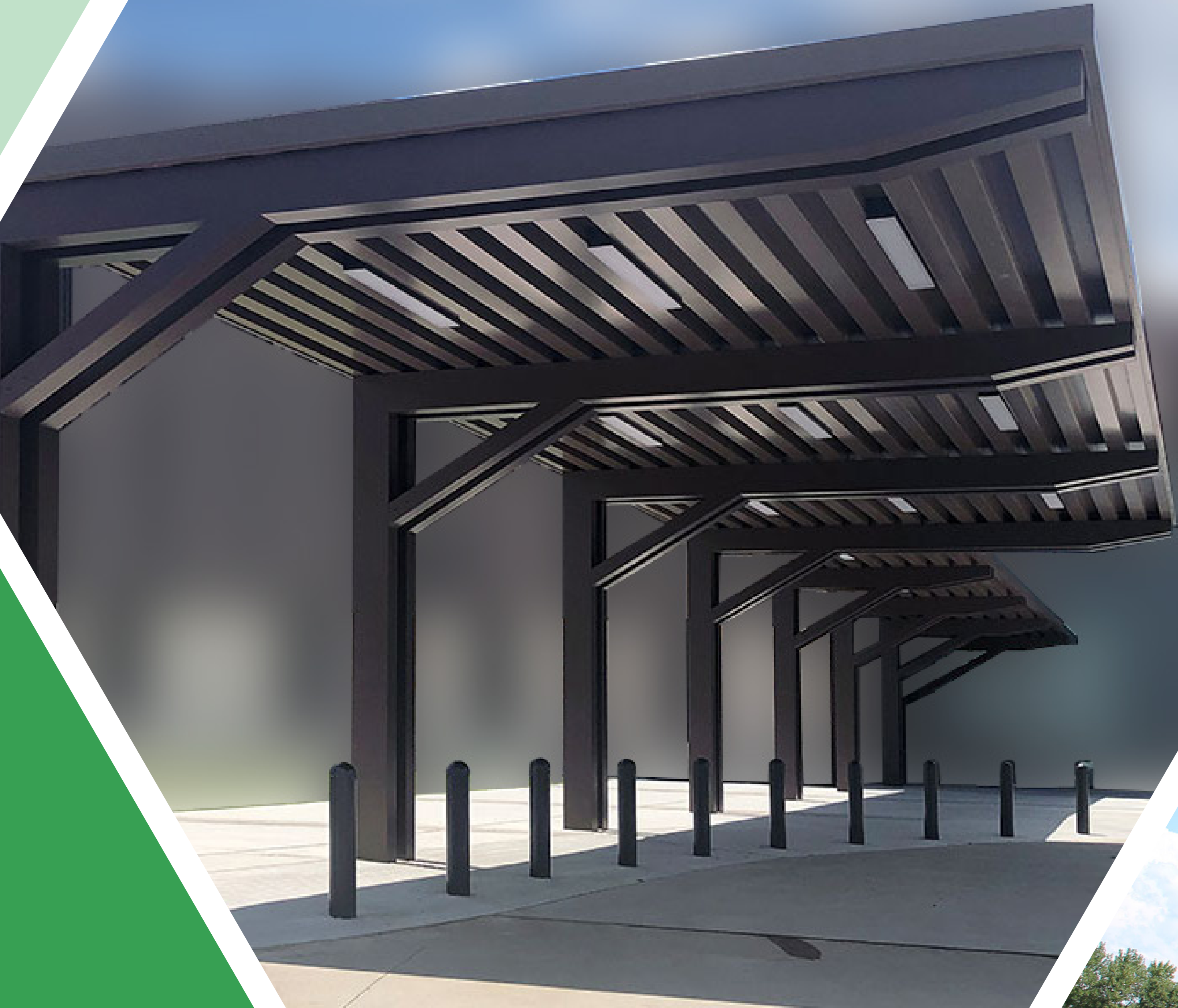
A CAR CANOPY EXTENSION