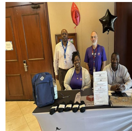
Outreach Community Event