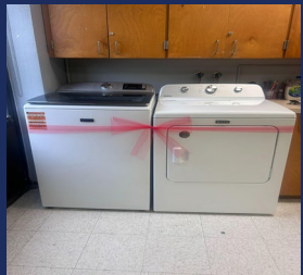
Degy Entertainment Palm Beach Lakes HS