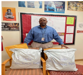
Delivery of Essential Supplies