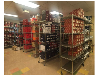
MVP Sneaker Closet