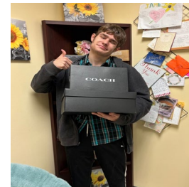
UHY Student Shoe Donation