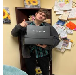
UHY Student Shoe Donation