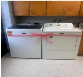
Degy Entertainment Palm Beach Lakes HS