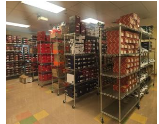
MVP Sneaker Closet