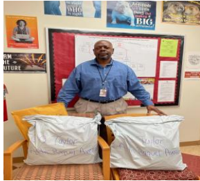
Delivery of Essential Supplies