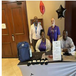
Outreach Community Event