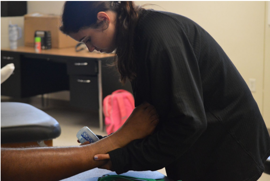
Gata Data Staff Photo By Jolie Villenurve

Student aids aren't just ‘water boys and water girls,’ they are the people who watch athletes' progression through their performances and treat other students according to their situation. Student aids are constantly in hectic environments, especially before games, when making sure that student athletes are properly treated, taped, and that all of the equipment and supplies are stocked and properly packed to be brought to the destination of the games. During the games, they watch the athletes and ensure that they are hydrated so that they perform at their best. After games, student aids make sure that they follow up with players who got injured during the game and treat them. They also follow up by ensuring that everything is