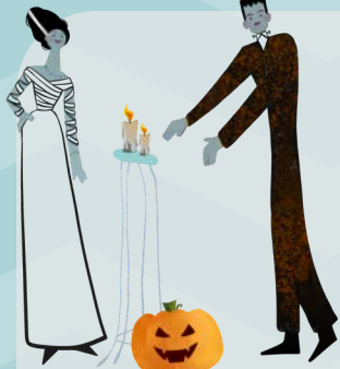
(NOT my wedding photo)