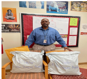
Delivery of Essential Supplies