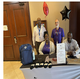
Outreach Community Event