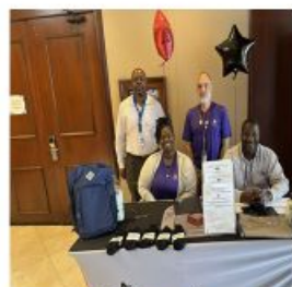
Outreach Community Event