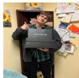
UHY Student Shoe Donation