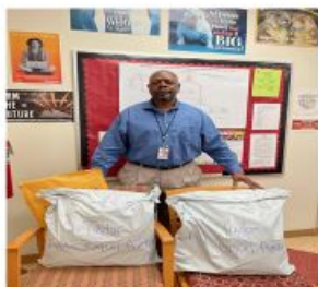
Delivery of Essential Supplies