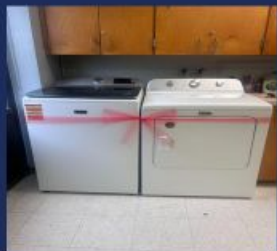
Degy Entertainment Palm Beach Lakes HS