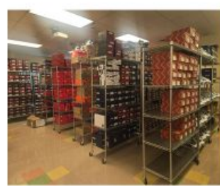
MVP Sneaker Closet