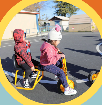
First Child Development Permit or upgrading to a higher level