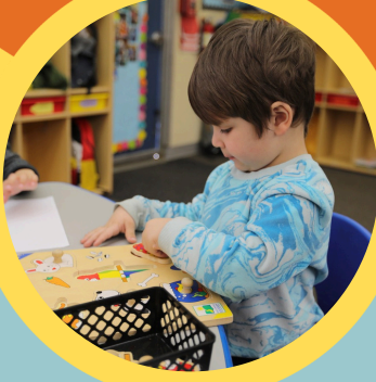
Unidades de el Colegio