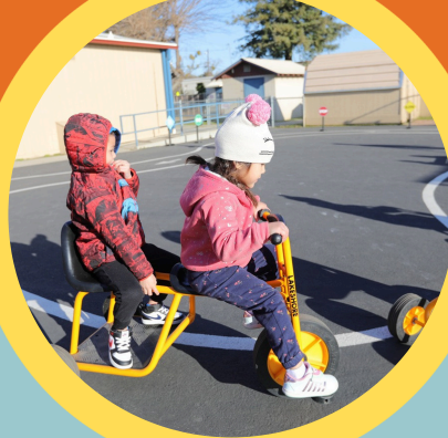
Primer permiso de desarrollo infantil o actualización a un nivel superior