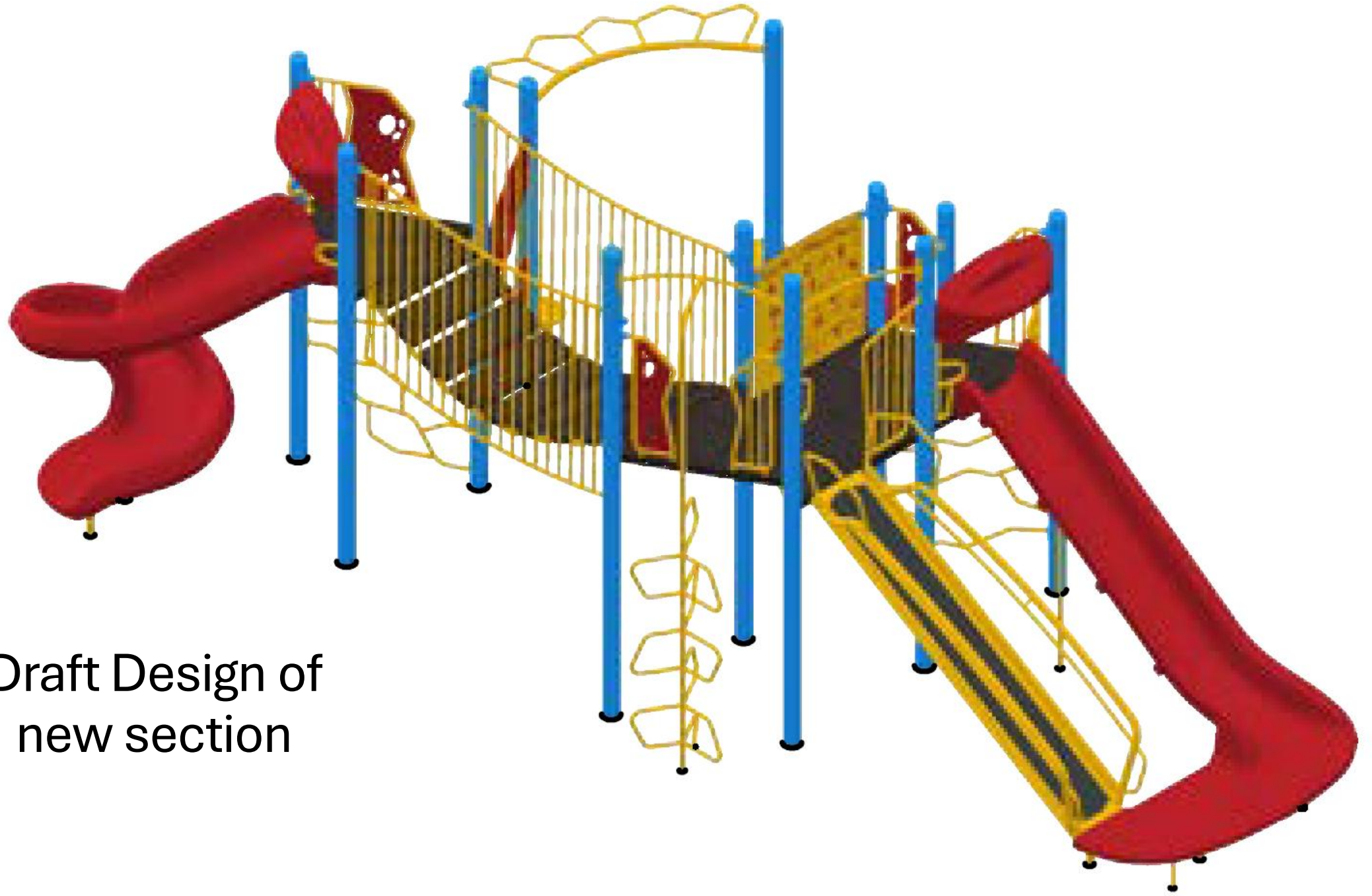
Draft Design of new section