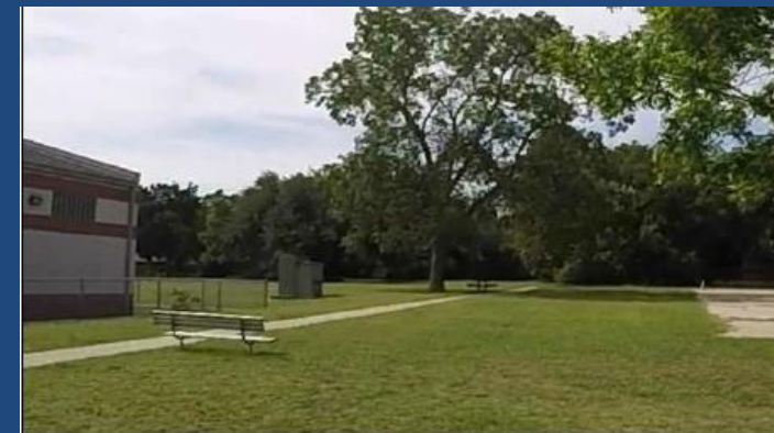
No accessible path of travel to play area.