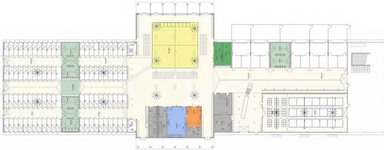
New Agricultural Science Building Denton ISD 10-30-2017 65,000 sf