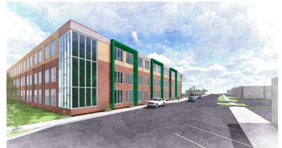
Conceptual rendering of the school's rear exterior.