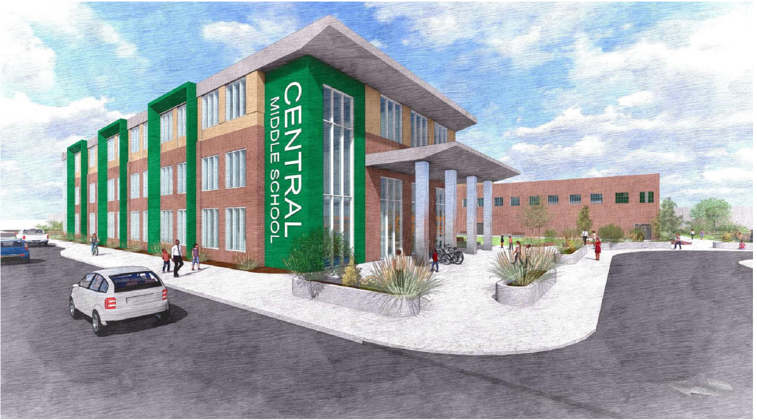
Conceptual rendering of proposed new Central Middle School.