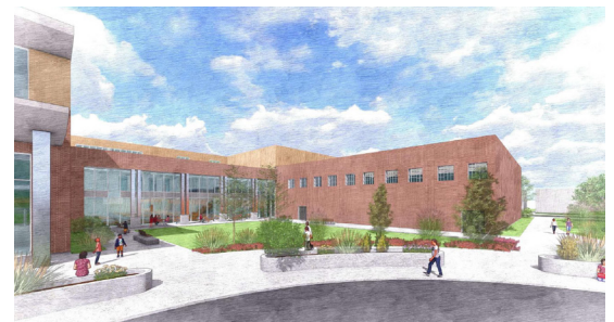
Conceptual rendering of courtyard at front entrance.