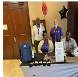
Outreach Community Event