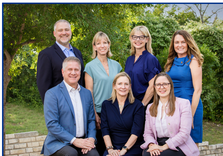
Eanes ISD Board of Trustees

When you join our district, you're not just enrolling in a school, you're becoming part of a community that celebrates family, excellence and opportunity.