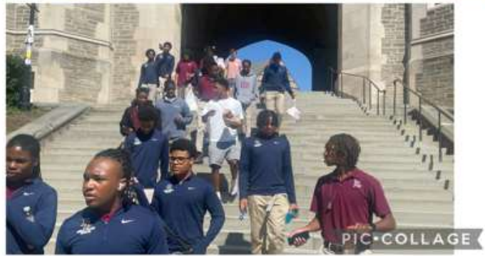
Boys' Latin at The Philadelphia High School Fair