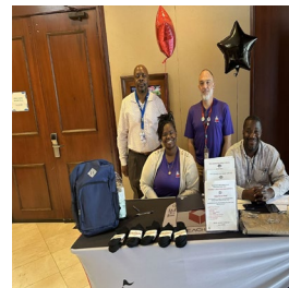
Outreach Community Event