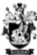
House of Givers