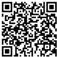
College Counseling Senior Meeting Notes