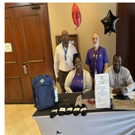
Outreach Community Event