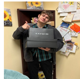
UHY Student Shoe Donation