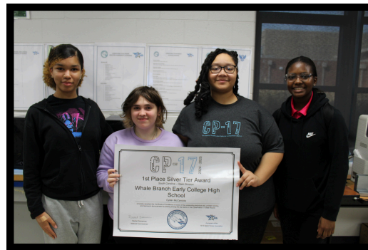
WBECHS receives funding for emerging cybersecurity, IT, and arts integrated focused pathways through the MedTech 7 grant.