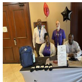
Outreach Community Event