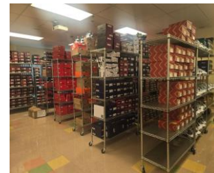
MVP Sneaker Closet