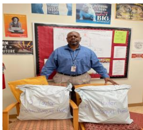
Delivery of Essential Supplies