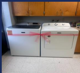
Degy Entertainment Palm Beach Lakes HS