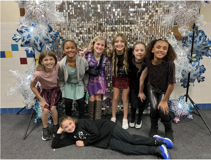
Winter School Dance Fun!