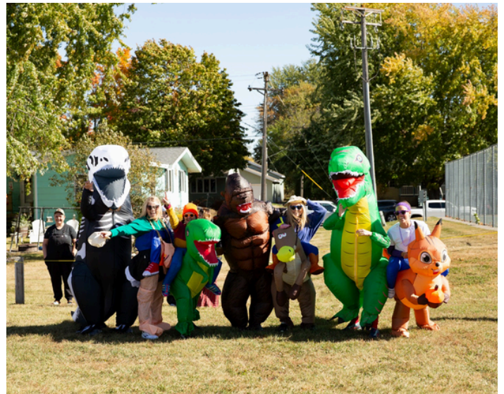
Fund Run Inflatable Race!