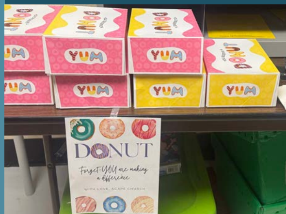
GES - Agape Church