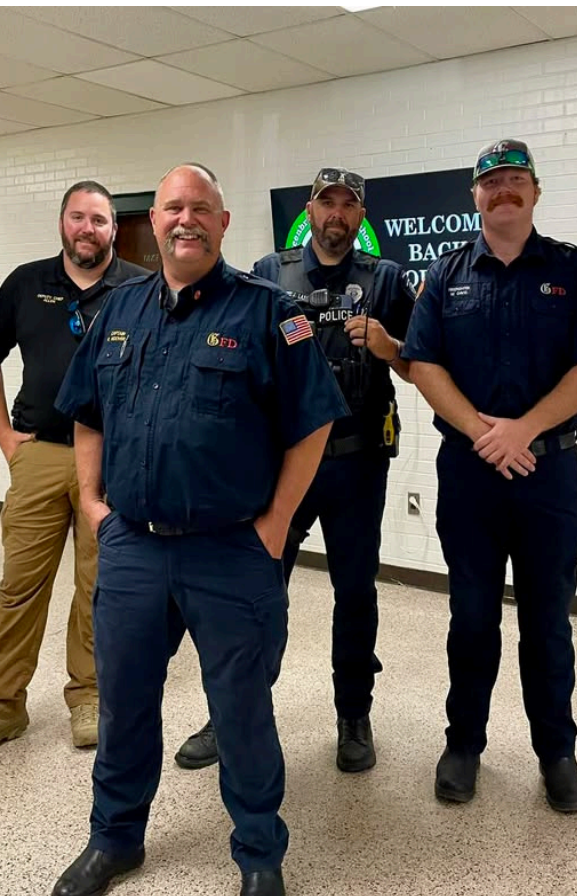
GMS - Greenbrier PD, Greenbrier Fire