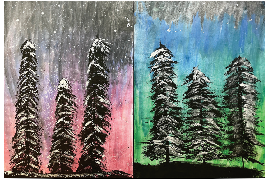
Lyndon Zheng - 5th Grade

The school district endeavors to ensure that no students miss important school work or activities because they are participating in a religious observance. Tests, trips and special activities are curtailed on those holidays that present the greatest conflicts for families. The dates of these days of religious observance are indicated in a shaded box on each month on the calendar.