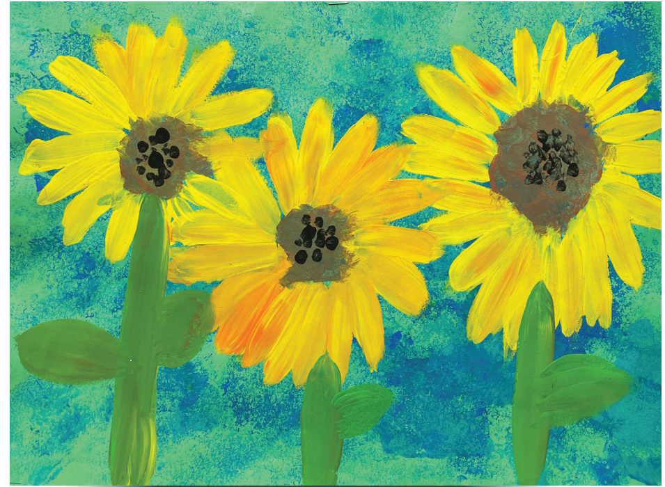
Skye Tenebruso - 3rd Grade