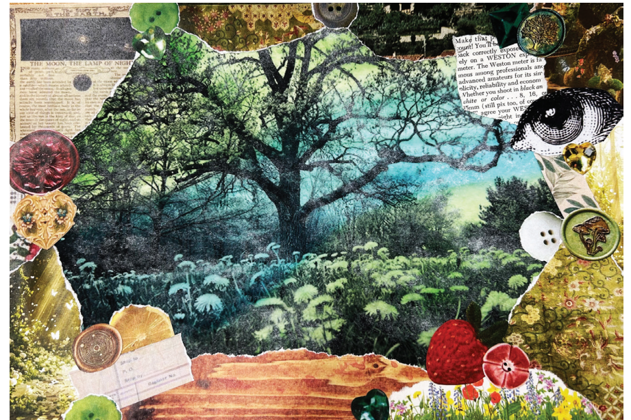
Katrina Chen - 10th Grade