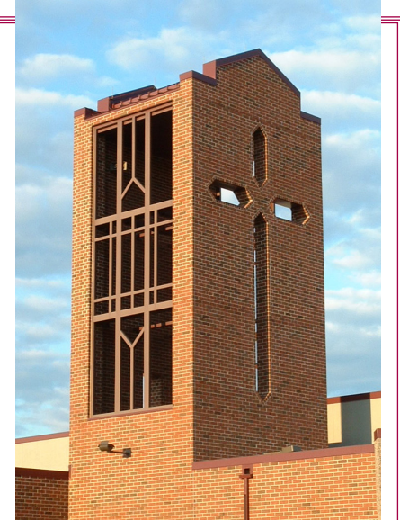
FOX VALLEY LUTHERAN HIGH SCHOOL

5300 N. Meade Street Appleton, WI 54913 Local: (920) 739-4441 Toll-free: (866) 454-3857 Fax: (920) 739-4418 Website: fvlhs.org