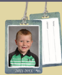
BACKPACK TAG Etiqueta para mochila