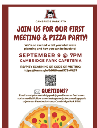
Pizza Party Meeting