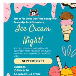
Sundae's Dine Out