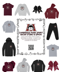
CPES Spirit Wear