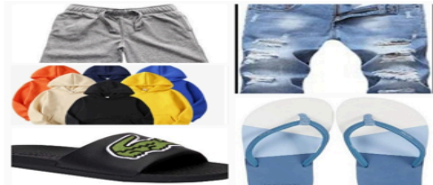
Do Not Wear to School

Emerson is not a free dress school! If you need assistance with uniforms please contact the office.