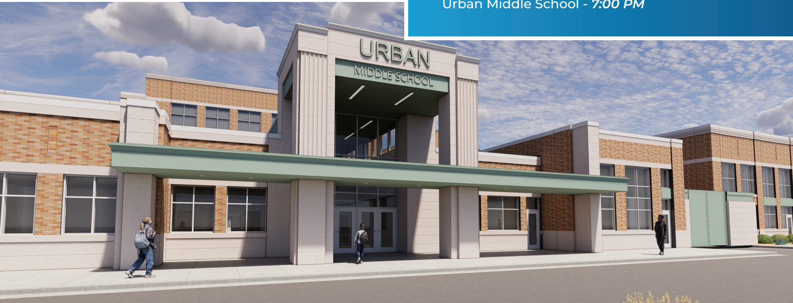
Urban Middle School Entrance Preliminary Rendering