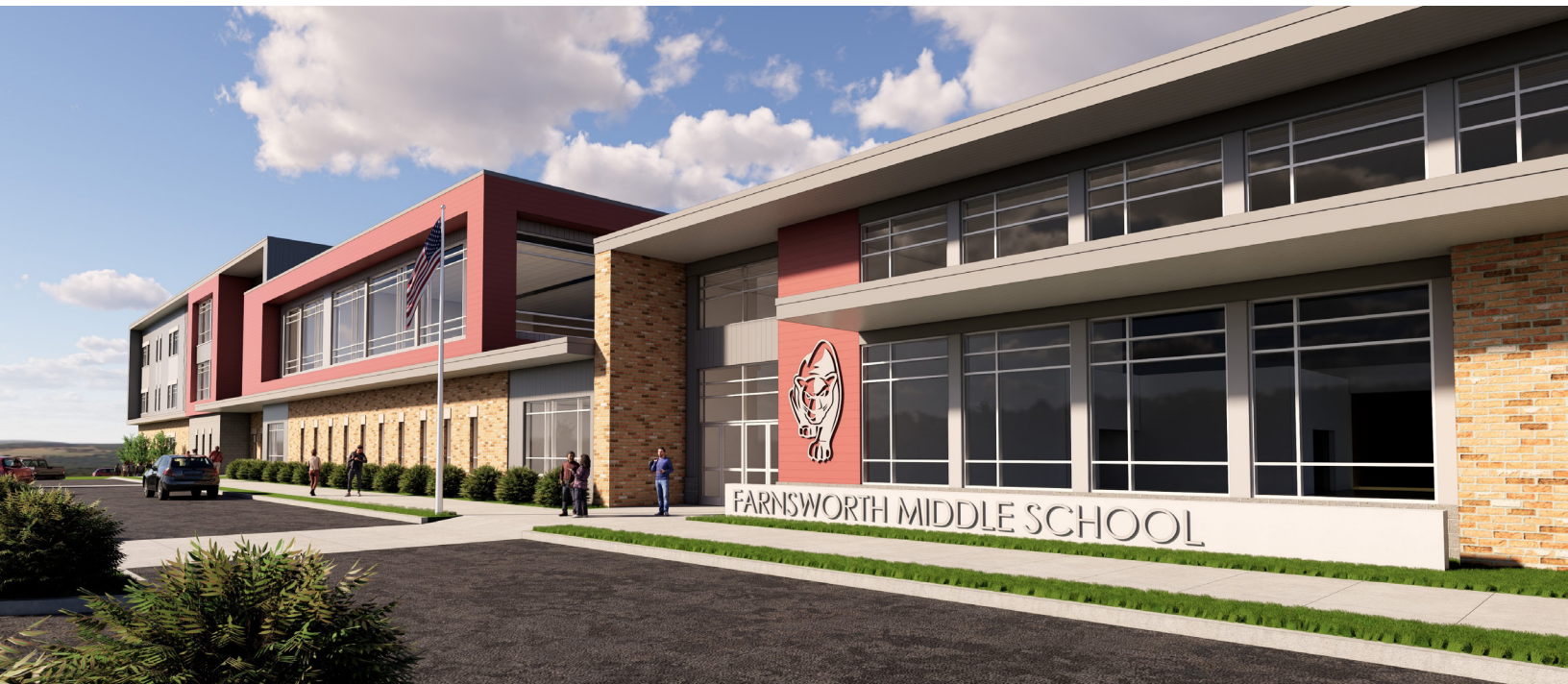
Farnsworth Middle School Entrance Preliminary Rendering

As the floor plans settle, we're excited to share some of the preliminary renderings included with this progress report. These early visuals were presented to the Board of Education on May 27 and will be shared with the community during upcoming information and feedback sessions at both middle schools on June 3. We encourage all community members to attend, hear the latest updates, and share their feedback on the preliminary designs!