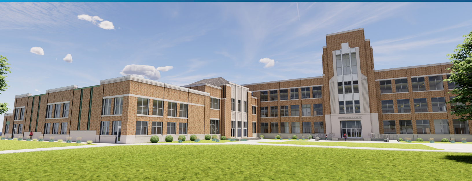
Urban Middle School Courtyard Preliminary Rendering

Contact Information: 920.459.3511 | web@sasd.net