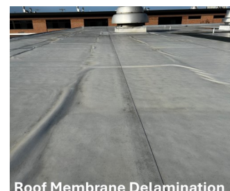
Roof Membrane Delamination