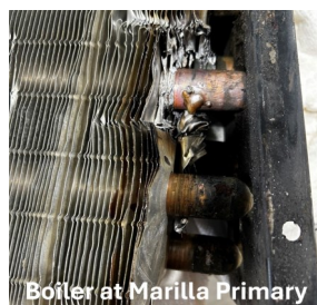
Boiler at Marilla Primary