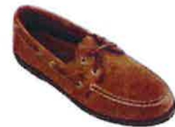
Sperry Men's Authentic Original Cross Lace Washed Stripe Boat Shoe (BROWN ONLY) Gr. 6-8