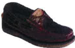
Sperry Men's Mako Casual Boat Shoe (BROWN ONLY) Gr. 6-8