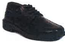
Oxfords (BLACK ONLY) Gr. 1-8