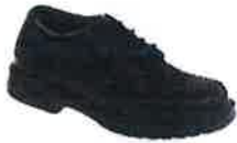
Lace-up Oxfords (BLACK ONLY) Gr. 1-8