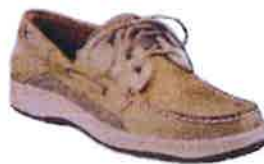
Sperry Men's Billfish 3-Eye Boat Shoe (BROWN ONLY) Gr. 6-8