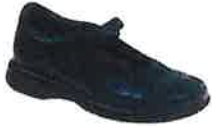
Mary Jane Flats NAVY Gr. 1-8

School uniform shoes can be purchased at the store of your choice but should adhere to the below examples