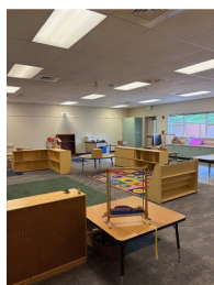
New Classroom Set Ups