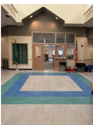
New Flooring and Paint