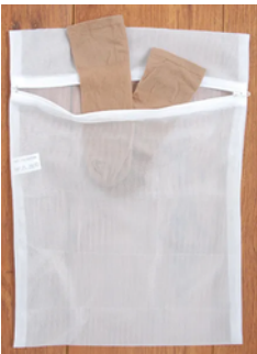
Example of laundry bag