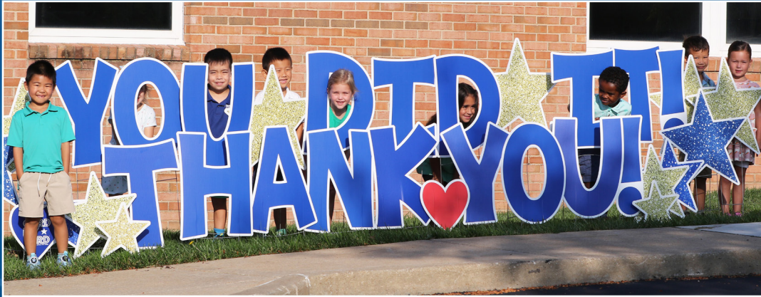
Rossman students greeting and thanking families after reaching our goal in 2024.

Enthusiastic participation in the Annual Fund Blitz has resulted in successfully securing pledges by the end of September. The Rossman community continues to show resounding commitment to the school and support of our Annual Fund staff and volunteers.