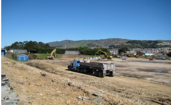
SSFHS Athletic Field – March 2014

Check Website for latest news: http://ssfusd.bond.swinerton.com/