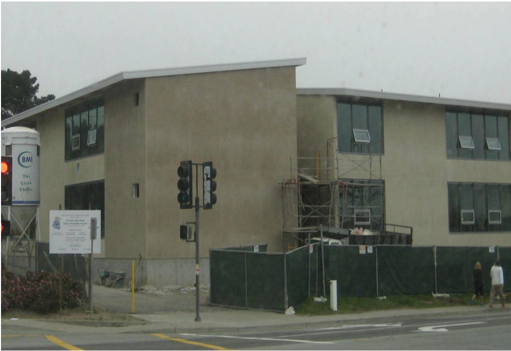
EL CAMINO SCIENCE BUILDING - MARCH 2014