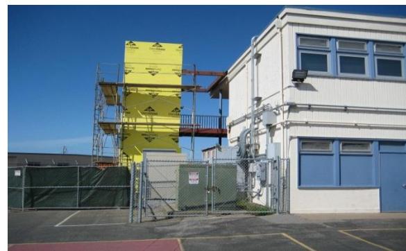
Spruce ES New Elevator Tower – March 2014

Summer 2014 projects are getting warmed up. Moving boxes and other activities prove construction is imminent at Spruce, Ponderosa and Westborough. These schools make up Phase Two Modular work. By the end of summer, they will join the other campuses with new state-of-the-art learning environments.