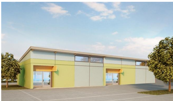
Parkway Heights Counseling Center