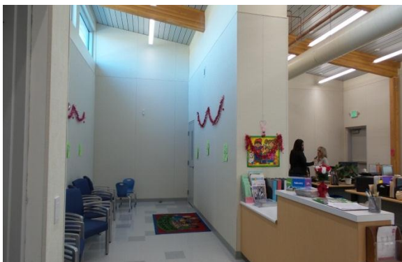
Buri Buri Admin Office – February 2016

On January 21, 2016, the SSFUSD Board of Trustees called a special meeting to address the ongoing concerns the District has had with the Measure J Bond program and its main contractor, USS Cal Builders. After reviewing a history of the bond work, and in light of the findings from the audit released last spring, the Board decided to pursue discontinuing its relationship with USS Cal Builders. Staff is in the process of reviewing how this transition will take place. Utmost attention will be taken to streamline these changes.