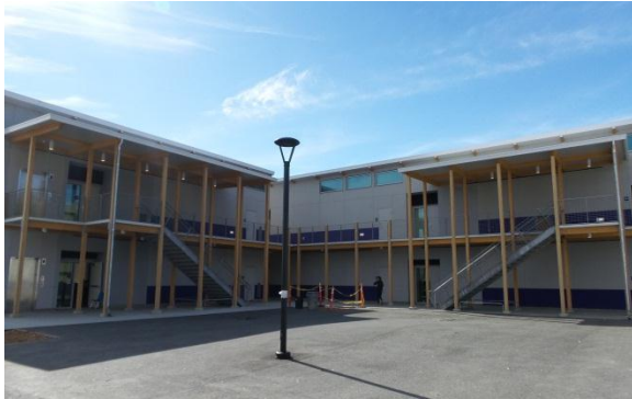
Parkway Heights West Campus – February 2016