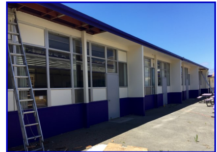
Parkway Painting Project— Classroom Wing painting & dry-rot repairs to roof soffits.