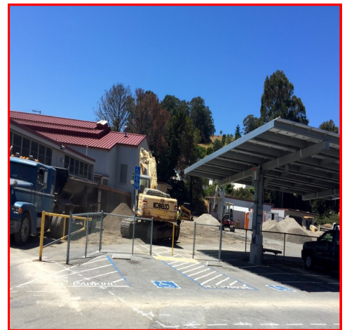
Right —Martin Site Work underway for site drainage repairs & utility installations.