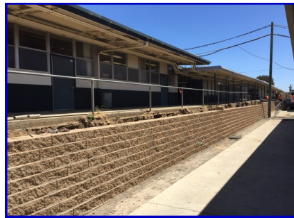
Parkway Site Work Project— Stacked Block Retaining Wall at Center of Campus