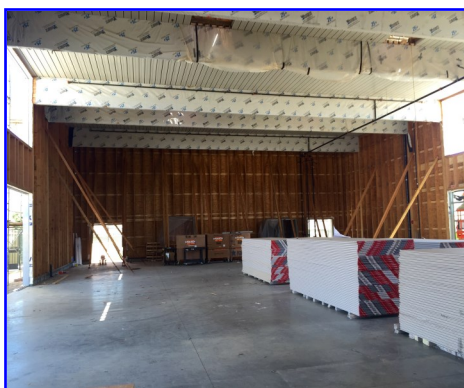
Buri Buri ES New Multi- Purpose Building Interior above