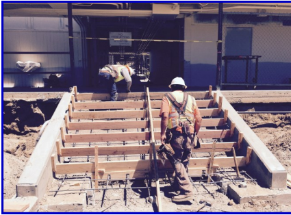
Parkway Site Work Project— New Central Stairs