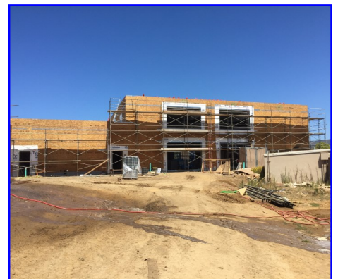
Buri Buri New MPR South Exterior

Window & Door Installation in progress— above