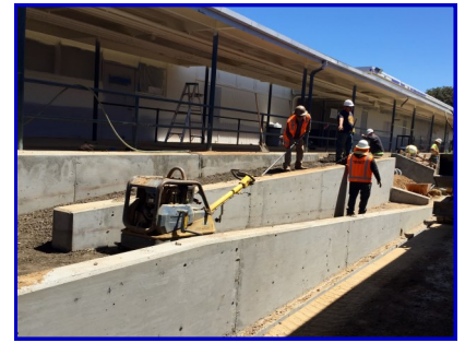
Parkway Site Work Project— New Handicapped Access Ramp at Center of Campus