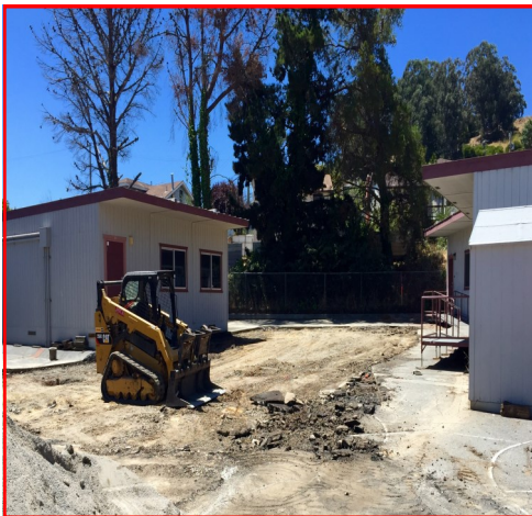
Left —Martin Modular Restroom Bldg. Installa- tion at new Pre-School Area, site prep & utility installation underway.