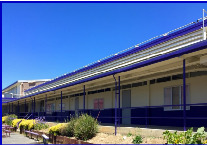
Parkway Painting Project— Exterior campus buildings to match new buildings.