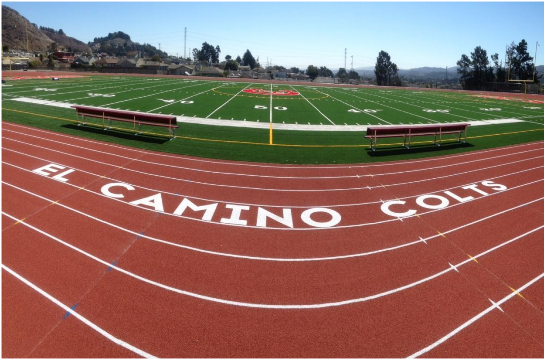
EL CAMINO TRACK AND FOOTBALL FIELD - OCTOBER 2013