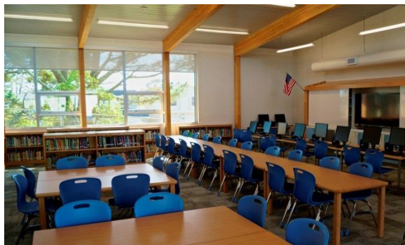
Skyline Elementary Library – October 1, 2013

The Bond Team, on behalf of the District staff and faculty of the SSFUSD, would like to thank the community of South San Francisco for supporting the Measure J projects. The District is working very hard to get the most bang out of each bond buck. With a very productive summer under our belt, we move on in confidence and excitement to the next set of projects.