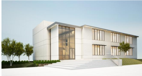
Two-story 20 Classrooms – SSFHS

South San Francisco High School 20 New Classrooms Modulars @ Spruce, Ponderosa & Westborough Parkway Heights Green Schoolhouse New Buri Buri Elementary School