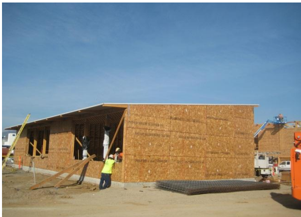
SSFHS 2 PK Classroom Building – January 2015

As everyone in South City knows, we had some pretty severe weather events last month; so severe that the Board of Trustees unanimously closed District schools for two days to ensure the safety of its students and staff, and to minimize the worry of our families. The Facilities Department was on standby to mitigate any serious consequences resulting from these storms. The Bond Team was on hand as well to monitor any damage the Bond projects might sustain. We are happy to report that no significant damage occurred.