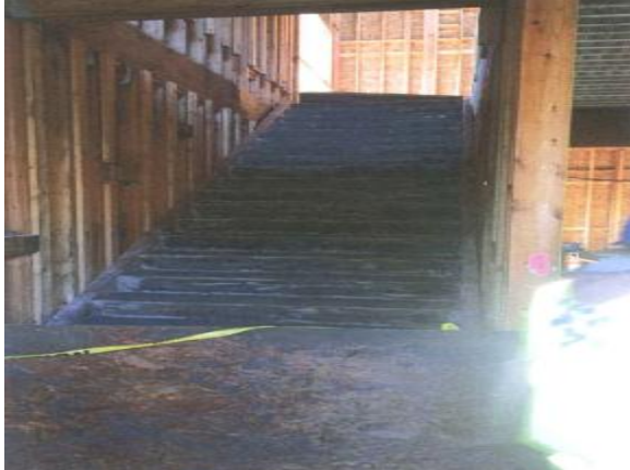
Parkway Heights Building D First Floor – January 2015

BURI BURI COMMUNITY MEETING @ BURI BURI LIBRARY CHECK WEBSITE FOR DATE & TIME: http://www.ssfusd.org/mjb