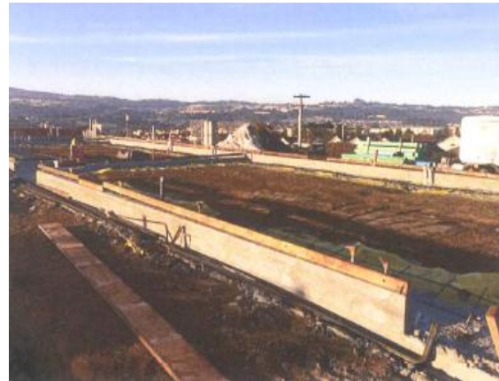
Parkway West Campus Footings – January 2015

Parkway Heights Middle School construction continues. The Parkway project is very complex. There is not only new construction taking place, but also a renovation of the locker room buildings. And initially, temporary housing was installed to house students until the new buildings were completed. So there is a lot of activity on this campus. The first building slated for completion is the first SSFUSD 12 PK. Twelve new 960 s.f. classrooms with new furniture will be the first classrooms of 33 new ones at Parkway. There will be another 12 PK classroom building at Parkway, and one is being built at SSFHS too.