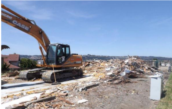
Parkway Heights MS Demolition - May 2014

Check Website for latest news: http://ssfusd.bond.swinerton.com/