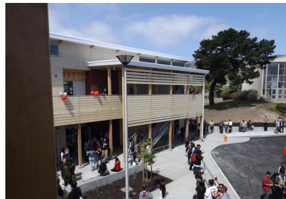
El Camino Science Building Dedication – April 15, 2014

Buri Buri Elementary School Renovation plans are set to be approved by DSA before the summer and the long awaited new campus will begin construction.