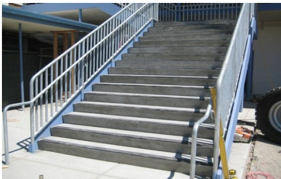
Spruce ES Staircase – May 2014

A major campus renovation has begun at Parkway. The Interim Housing was installed this spring, and students have moved in. Portable demolition and/or removal has begun and then work will begin on the Boys' and Girls' Locker Room Buildings to convert one into new locker rooms and the other into two classroom spaces. Further work will begin this summer with the first of many new modular buildings. By this time in 2016, Parkway will be a completely new campus.