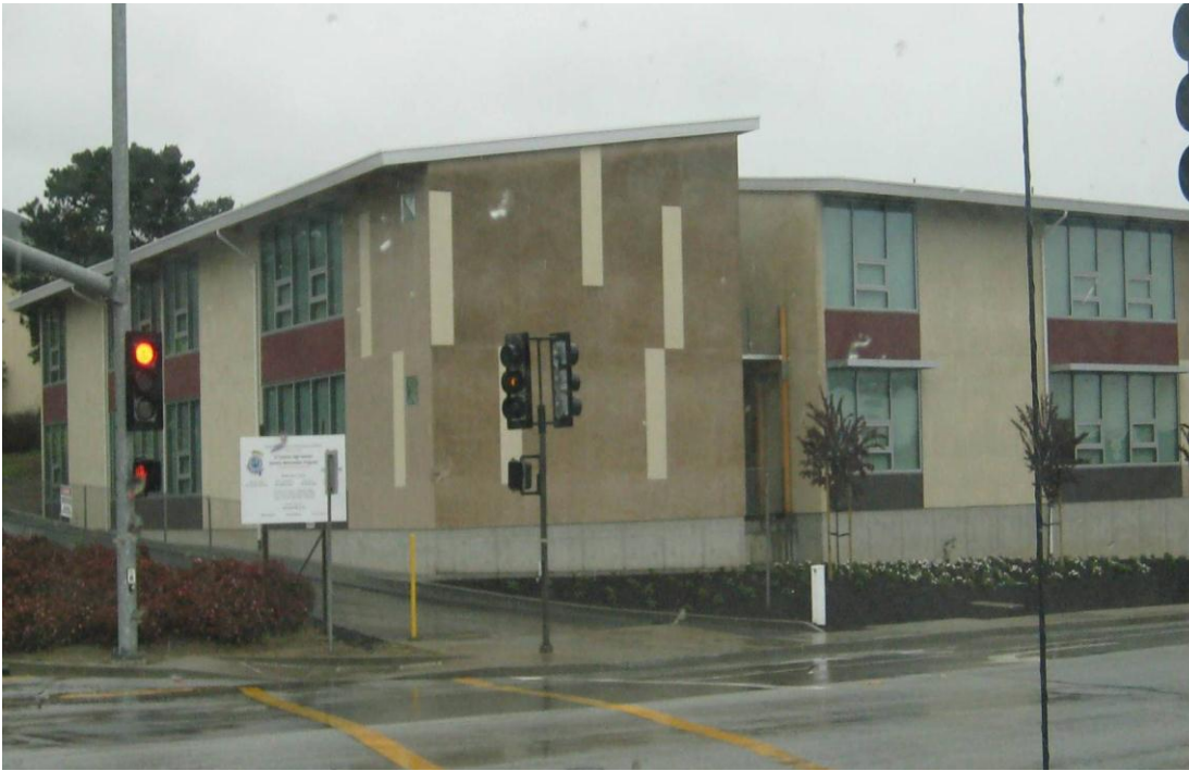
EL CAMINO SCIENCE BUILDING - MAY 2014