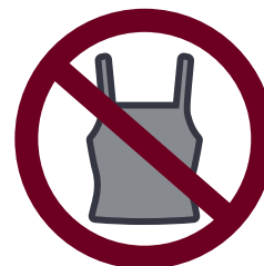
NO REVEALING CLOTHING