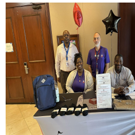
Outreach Community Event