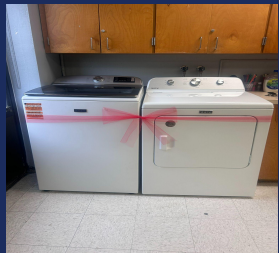
Degy Entertainment Palm Beach Lakes HS