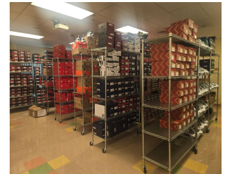
MVP Sneaker Closet