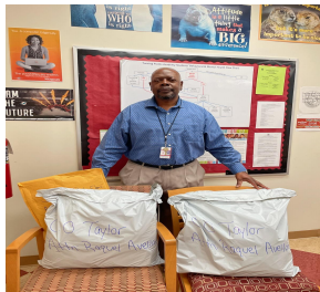
Delivery of Essential Supplies