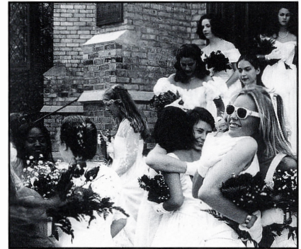
Members of the Class of 1995—the Alumnae Association's newest members

continue to "promote the interests of the school" with as much "merriment, good will and vigor" as it has.