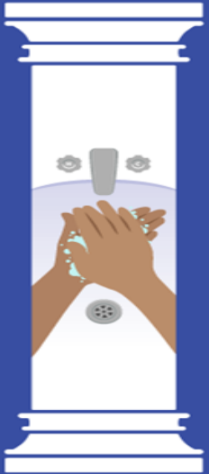
Health & Hygiene