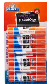
6 Elmer's glue sticks