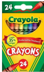
1 box of 24 Crayola Crayons