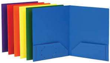
2 Pocket Folders – 1 with Prongs and 1 without