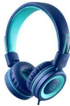
1 Pair of Headphones