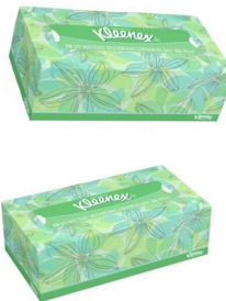
1 boxes of tissues