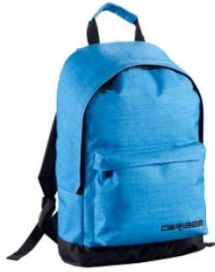
1 backpack to bring to school every day