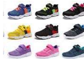
Pair of P.E. shoes (if possible, to keep at school)