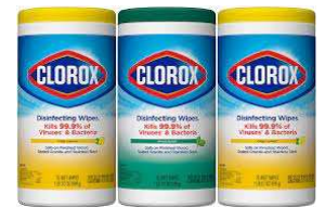
Clorox or Lysol Wipes