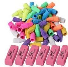
2 Pink Wedge Erasers & 1 Pack of Pencil Top Erasers