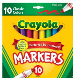
1 box of 10 Crayola Broad Line Markers