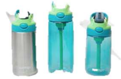
1 Water bottle with a tight fitting lid