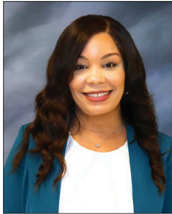
Barquita Stanton Spann Elementary School