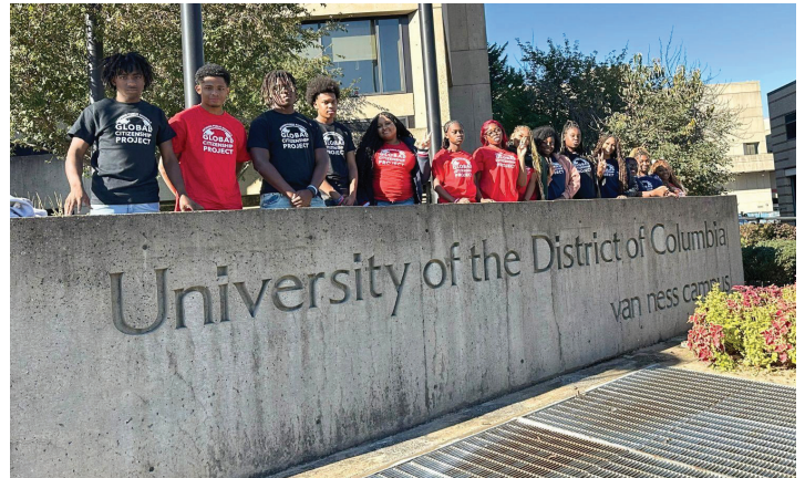
JPS Global Citizenship Project scholars visited several institutions of higher learning as part of the program's annual educational trip to Washington, D.C.