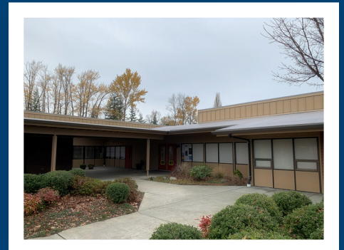
Roosevelt Elementary School

Included in the 2022 bond, two schools will be planned, designed and permitted to shovel ready; the third school will start initial programming and planning. Construction for all three schools will be proposed and funded on a future bond.