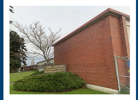
Carl Cozier Elementary School