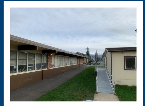
Columbia Elementary School