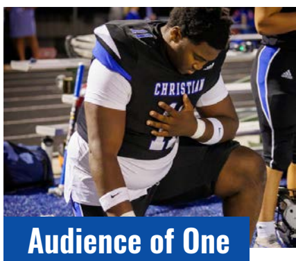
Audience of One

The high school experience includes many special events and celebrations to honor and thank our Lord. Those programs include Senior Convocation, Senior Retreat, Freshman Retreat, Baccalaureate, and Night of Worship.