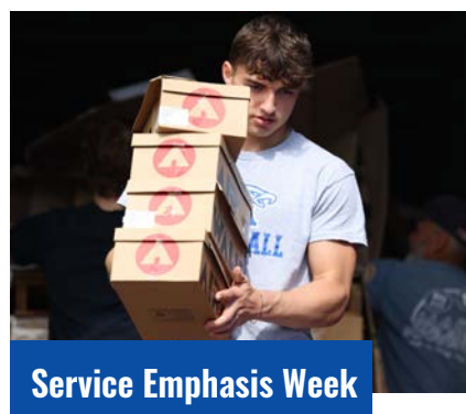
Service Emphasis Week

Each fall, the high school hosts a "Spiritual Emphasis Week," where outside speakers challenge our students to grow closer to Christ. Sessions are filled with wisdom, encouragement and worship.