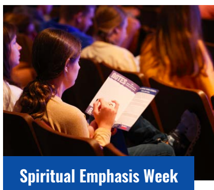
Spiritual Emphasis Week

LCA is blessed to employ an Athletics Chaplain and Christian coaches who emphasize the importance of performing for an "Audience of One." Each of our sports programs include prayer and devotion as part of their weekly activities. We believe we must be grateful for and honor the One who provides the talents we have been given.