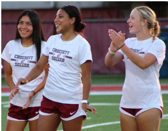
Above: The soccer team's seniors celebrate each other.