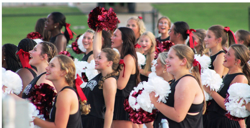
Above: "Meet the Cavs" is a fundraiser for Crockett's cheer team (pictured here). Following are various people and scenes from the evening at Cavalier Stadium.